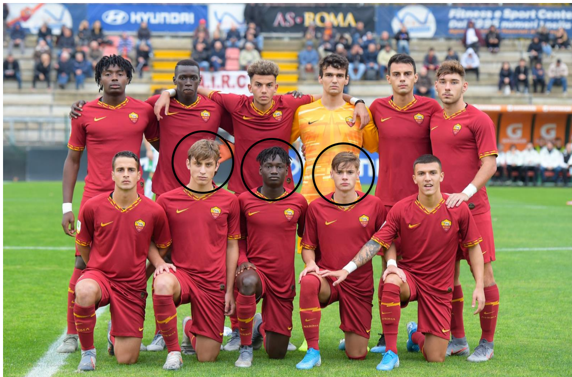
Roma – Sassuolo (4-2) played on 29 November 2019 at the Stadio Tre Fontane in Rome. Campionato Primavera 2019-2020.