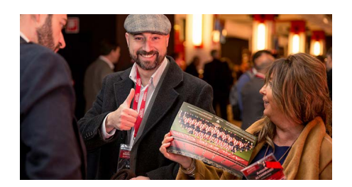
Go home with {\bf 10} new ideas

This conference will gather top executives from the stadium industry to present new trends, share ideas and build relationships aimed at shaping the future of sports facilities. We are delighted to partner up with ESSMA in hosting this event which should be a must for anyone interested in the venue business.